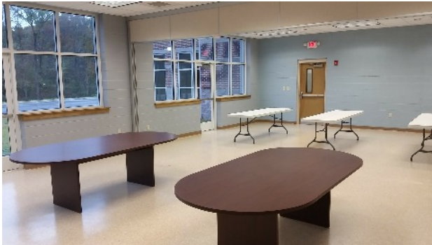
Business Room A & B